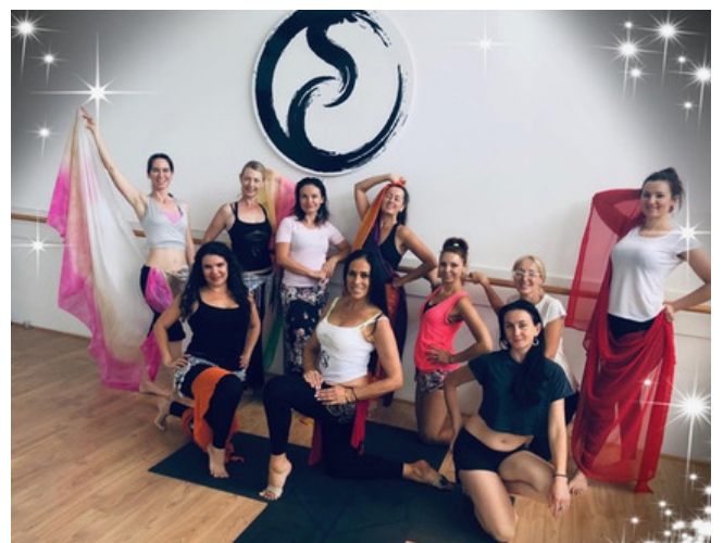
At the Belly Dance Summer Workout Workshop