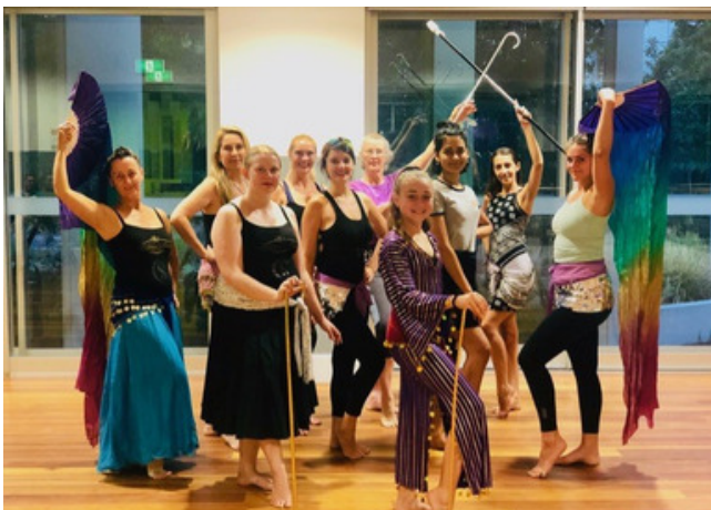
The Robina Dreams of the Desert learning how to dance with the stick (Assaya) and fan veils.