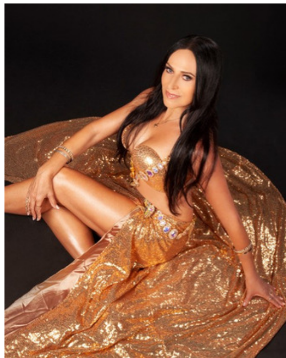
Top: Diamonds of the Desert

Contact: Phone: 0400 881 815 Email: info@bellydancegoldcoast.com.au Web: www.bellydancegoldcoast.com.au